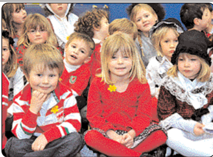
RIGHT: A Welsh version of Stonehenge!

Prizes were given for models relating to Welsh landmarks, recitation and school-work, all leading up to the charring of the bard.